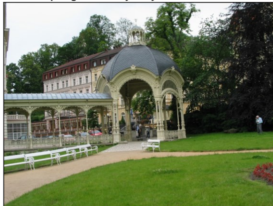
Hot water spring in Karlovy Vary