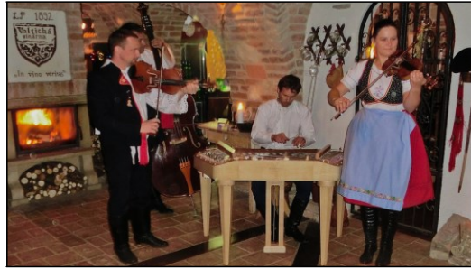
Mikulov wine cellar